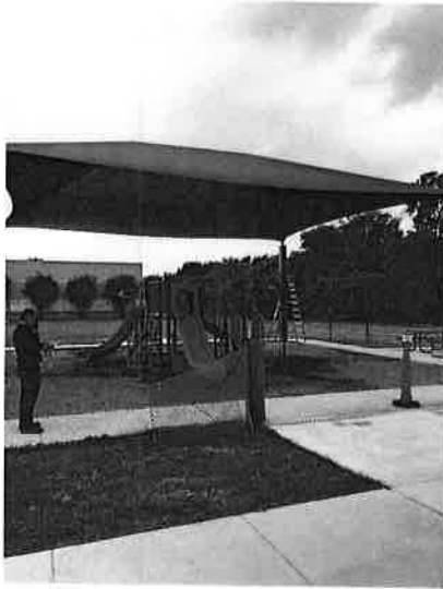
South Benbrook Park

On February 13, 2019, the Parks Board approved the colors for the new shade structures to be constructed at South Benbrook Park, Timber Creek Park and Twilight Park. The shades have been installed by Parks staff and have been well received by the public.