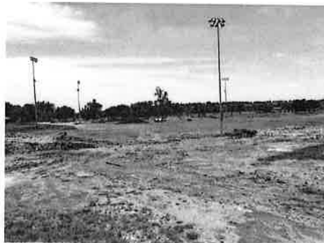
New Baseball Field

No vote was taken on this item since it was for informational purposes.