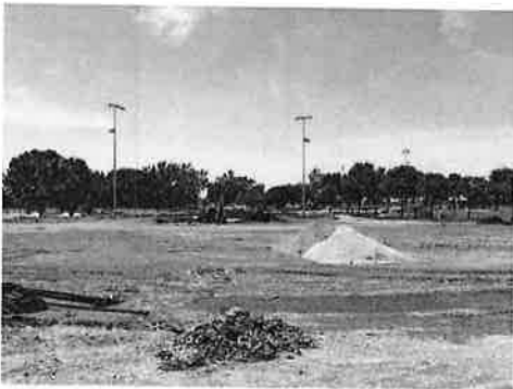
New Softball Field

Construction is scheduled to be completed by the end of January 2020.