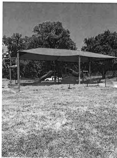
Timber Creek Park